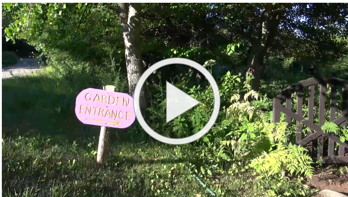
Tending the Soil at Avena Botanicals

In case you missed it, the ABC-AHP-NCNPR Botanical Adulterants and Prevention Program recently published a bulletin on the adulteration of Ashwagandha roots and extracts . Since 1988, the ABC has been educating consumers, healthcare professionals, researchers, educators, industry and the media on the safe and effective use of herbs and medicinal plants. You can find out more about their work here .